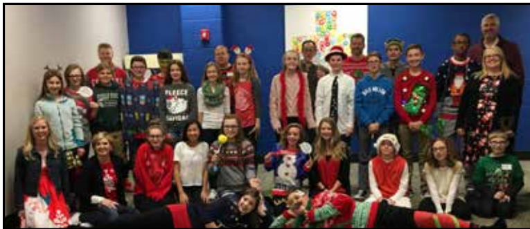
CLC Fishers confirmands in their ugly Christmas sweaters!