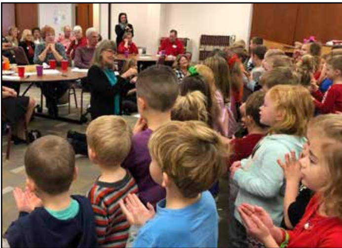
The senior adults love it when the CLC Preschool students come and sing at the December luncheon!