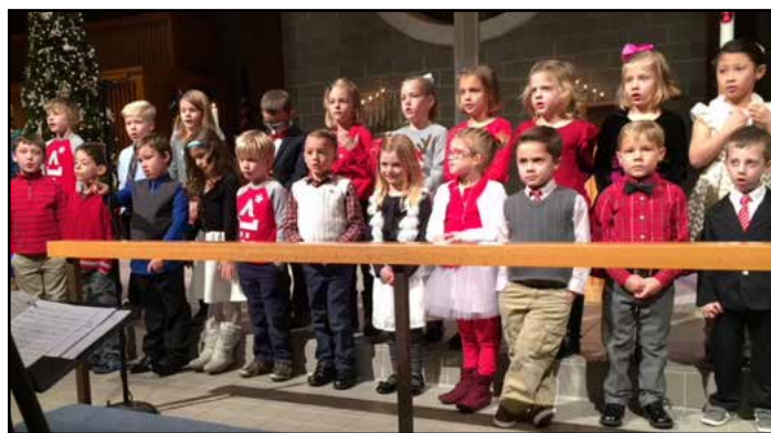
Primary Praise singing at December's Lessons & Carols service.